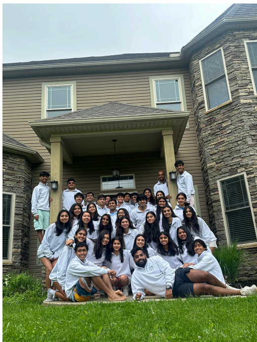
37 of our amazing attendees!